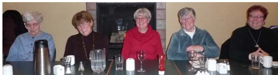
ACW Ladies New Year's Dinner

On January 12 th 2009 the ladies of All Saints Church went to ABC restaurant for our annual winter dining out evening. There were 18 ladies in attendance to enjoy our gay repast. We were hosted in a private area with warm fireplace aglow and great ambience.